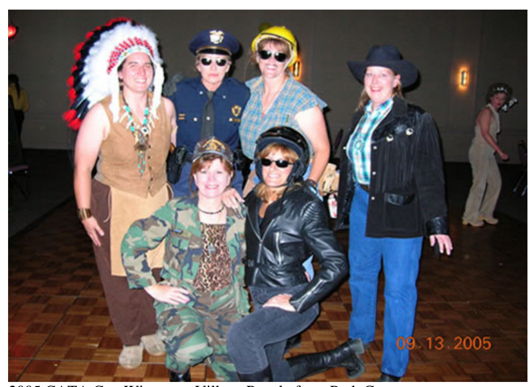
2005 CATA Cup Winners – Village People from Park County