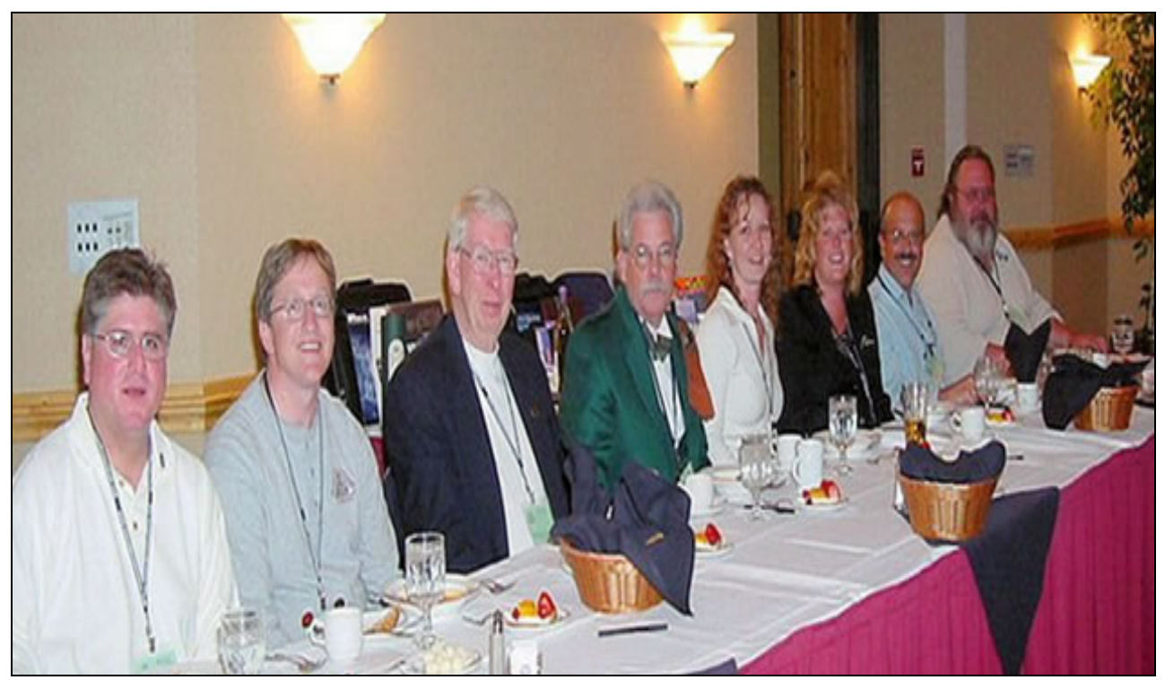
2005 CATA Board Members