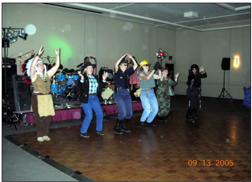
Its fun to stay at the YMCA!!!